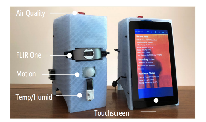
Figure 1: Our temporal thermographic sensor system, Thermporal , is designed to collect and store all the data necessary for performing quantitative analysis of insulation performance and includes: a FLIR One thermal camera, environmental sensors, and a Wi-Fi connection for accessing weather data; users primarily interact with the system using a touchscreen display.

To address these challenges, we present an easy-to-deploy, temporal thermographic sensor system (Figure 1) designed to support residential energy audits through a quantitative analysis of imagery from multiple time-series captures of a building's envelope. Our custom-built system, called Thermporal, combines low-cost, off-the-shelf hardware with a novel software suite to semi-automatically collect, analyze, and report on temporal thermographic data from nightly scans. Prior work in temporal thermography has focused on algorithmic performance and evaluations in controlled, unoccupied spaces (e.g., [10,18]). In contrast, our primary research questions are human-centered: What might users learn from temporal thermographic assessments of building envelope performance? How does using our temporal thermography system influence user behaviors or perspectives? What do professional auditors think of temporal thermography systems and how do their views differ from homeowners? And, finally, what design implications are there for future thermographic systems?