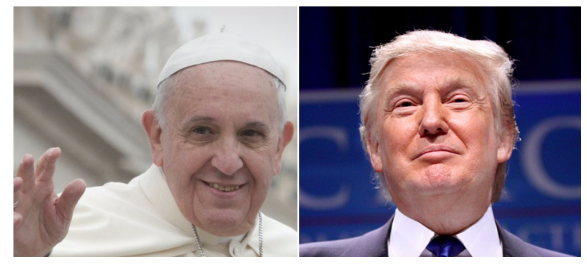
Figure 1: Fake news.

systems and been co-opted as a political weapon against anything (true or false) with which a person might disagree. Identifying fake news can be a challenge because many information items are called "fake news" and share some of its characteristics. Satire, for example, presents stories as news that are factually incorrect, but the intent is not to deceive but rather to call out, ridicule, or expose behavior that is shameful, corrupt, or otherwise "bad". Legitimate news stories may occasionally have factual errors, but these are not fake news because they are not intentionally deceptive. And, of course, the term is now used in some circles as an attack on legitimate, factually correct stories when people in power simply dislike what they have to say.