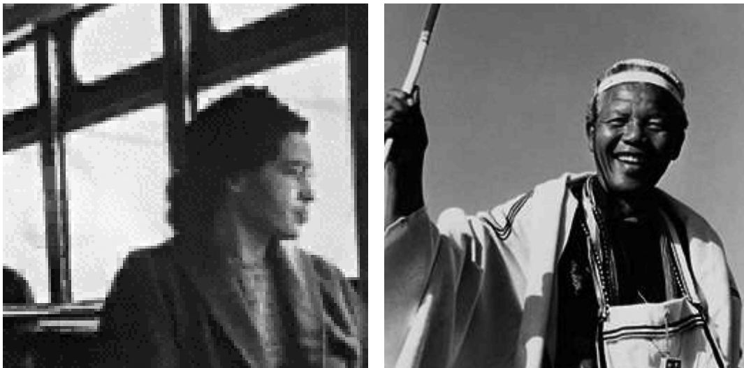
Figure 2: Rosa Parks (1955) and Nelson Mandela (1990)

Each matrix entry gives rise to a small square which is shaded a constant gray level according to its numerical value. We refer to these little squares as pixels ; they are more noticeable as individual squares when we view the images on a larger scale, such as in Figure 2(a). Given enough of them on a given region of paper, as in the 256 \times 256 pixel 8-bit image of Nelson Mandela in Figure 2(b), we experience the illusion of a continuously shaded photograph.