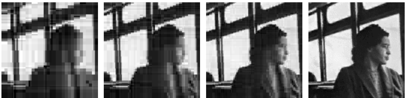
Figure 1: Person in bus

What these examples all have in common is information transmission at various levels of detail . In the first example, each person received information up to, but not beyond, a certain level of detail. The second example illustrates progressive information transmission : We start with a crude approximation, and over time more and more details are added in, until finally a “full picture” emerges. Figure 1 illustrates this pictorially: looking from left to right we see progressively more recognizable images of Rosa Parks.