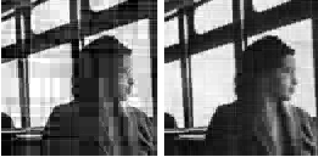
Figure 5: 10:1 compressions of the Rosa Parks image

Now we consider more realistic, larger image matrices, such as the one in Figure 2(a). Let's take \epsilon = 200 . We process the entire 128 \times 128 matrix, which involves 7 rounds of row averaging and differencing followed by 7 rounds of column averaging and differencing, and then set to zero all entries which do not exceed 200 in absolute value. Finally we apply the inverse wavelet transform. We obtain the rather poor compressed image shown in Figure 5(a), and a compression ratio of 10:1.