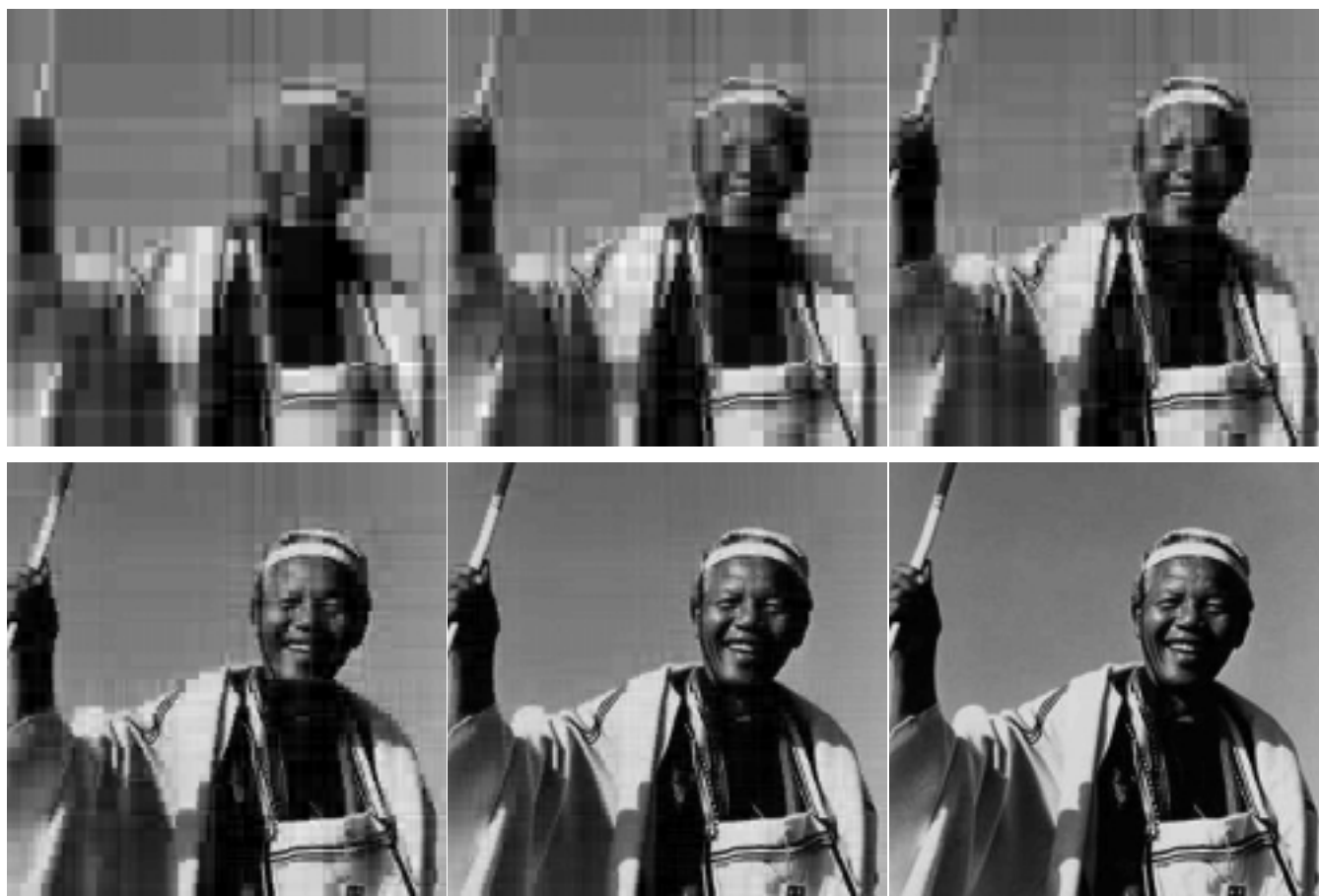
Figure 7: The ever progressive Nelson Mandela

For instance, the images of Rosa Parks in Figure 1, which use normalized wavelet compression with ratios of 50:1, 20:1, 10:1, and 1:1 (i.e., the original), respectively, could form stages in a progressive transmission, finishing up with a perfect image. Figure 7 shows another example using the Nelson Mandela image. Again, normalized wavelet compression is used here, this time with ratios of 200:1, 100:1, 50:1, 25:1, 10:1, and 2:1 respectively. The “half Nelson” in the last image is such a good approximation that it’s almost indistinguishable from the “whole Nelson” in Figure 2(b).