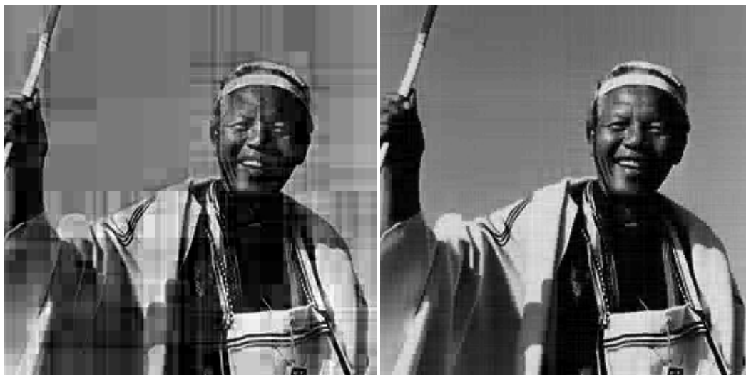
Figure 6: 10:1 compressions of Nelson Mandela image

The averaging and differencing which is at the heart of the wavelet transform earlier involves repeated processing of certain pairs (a, b) to yield new pairs (\frac{a+b}{2}, \frac{a-b}{2}) . In the normalized wavelet transform , we process each such pair (a, b) to yield (\frac{a+b}{\sqrt{2}}, \frac{a-b}{\sqrt{2}}) instead. Until we get to §5, this new form of averaging and differencing will likely seem unintuitive and unmotivated. Certainly, we have a reversible transform. We do not inflict any explicit examples of normalized wavelet transformed strings or matrices on the reader, but content ourselves with exhibiting the resulting compressed images. For a given compression ratio, normalization generally leads to better approximations, as we just saw in Figure 5(b).