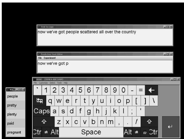
Figure 2: View of the copy task with word prediction