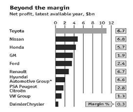
Figure 1: An Example Infographic